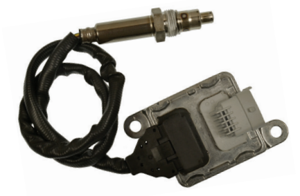
NOX1012 - SCR Catalyst Outlet Ram Trucks w/ 6 Cyl. 6.7L Engines (2017-14)