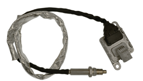
NOX1011 - Upstream Ram Trucks w/ 6 Cyl. 6.7L Engines (2018-13)