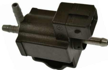
TCBV1004 GM (2020-11) VIO Over 2 Million