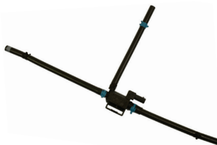
TCBS1003 Ford (2019-13) VIO Over 1 Million