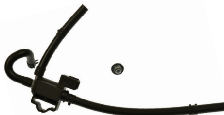
TCBV1005 GM (2020-11) VIO Over 2 Million