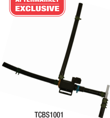
TCBS1001 Ford (2019-10) VIO Over 5.7 Million