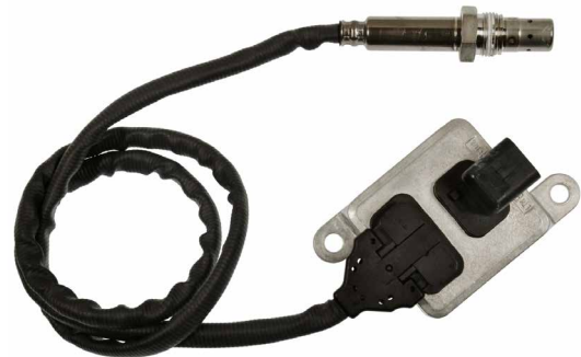
NOX1002 - Upstream

Chevrolet & GMC Trucks w/ 8 Cyl. 6.6L Engines (2014-10)