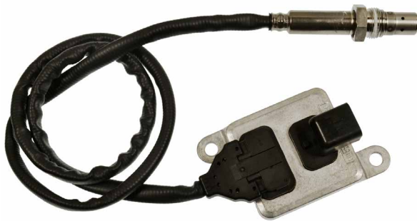
NOX1001 - Downstream

Chevrolet & GMC Trucks w/ 8 Cyl. 6.6L Engines (2014-10)