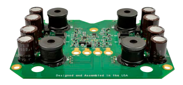
R76001 Ford 6.0L Diesel Trucks 2010-03 VIO over 700,000