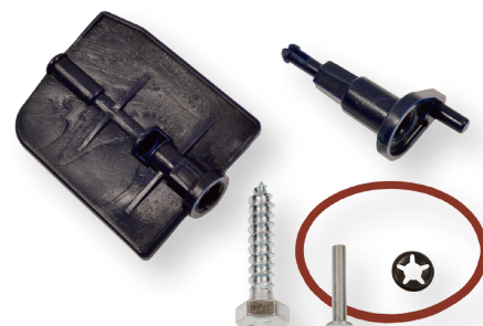
F66003 DISA Valve Repair Kit BMW 2006-01 VIO over 450,000