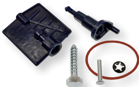
F66001 DISA Valve Repair Kit BMW 2000-97 VIO over 330,000