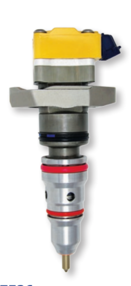
67526 Ford F Pickup, E-Vans (2003-99) International Trucks (2002-99)