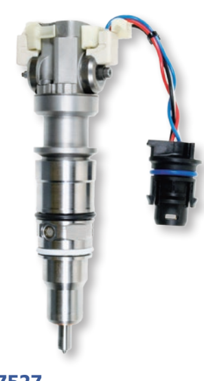
67527 Ford F Pickup (2004-03) International Trucks (2003-02)