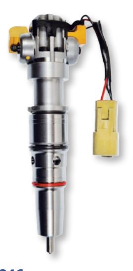
67846 International Trucks (2005-04)