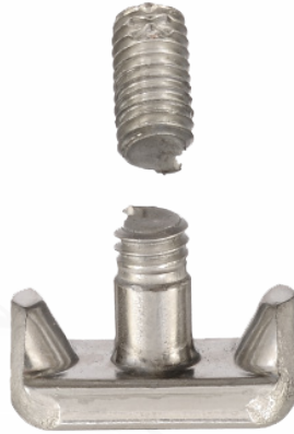
Broken OE Bolt

The battery cable bolts used on late model GM trucks have low torque specifications. As a result, they break easily during routine servicing. In the past, the broken bolt was commonly repaired in one of three ways: purchasing a new OE bolt from the dealer, installing a universal-style emergency terminal, or using a hose clamp. However, the dealership bolts can be expensive, the universal terminals are not a direct fit, and the hose clamp repair is temporary and unprofessional.