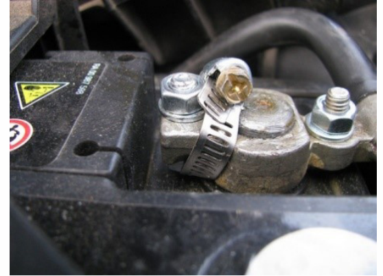
Temporary Hose Clamp Repair