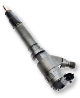
63871 GM Pickups (2005-04)

Here are some of our top selling Remanufactured Diesel Fuel Injectors for Common Rail Injection (CRI) systems: