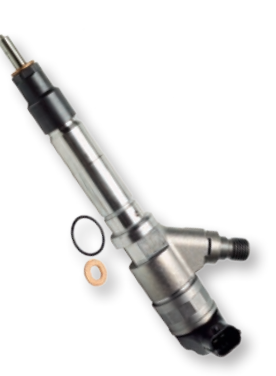
67561 GM Pickups, Fullsize Vans (2010-07)