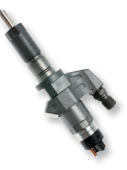
63877 GM Pickups (2004-01)