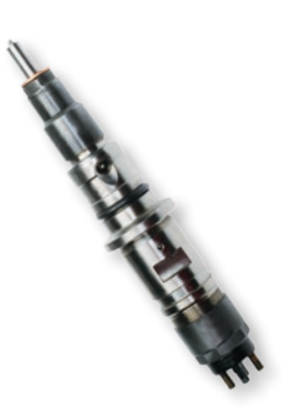
67617 Dodge Pickups (2010-07)