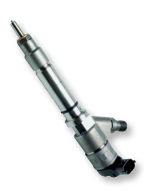
67562 GM Pickups, Fullsize Vans (2007-06)