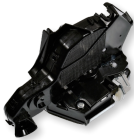
DLA1535 Toyota Corolla (2013-09) Toyota Matrix (2013-09) Toyota Tundra (2013-07) VIO Over 2.5 Million