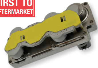
TCS37 Ford Trucks and Full-Size Vans (2004-98) VIO Over 3.2 Million