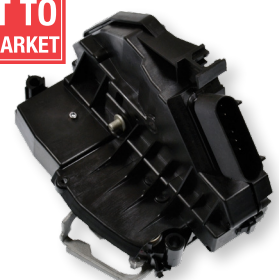
DLA1585 Ford Edge (2013-12) Ford Escape (2015-13) Lincoln MKC (2015) VIO Over 1.5 Million