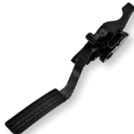
PPS1262 Buick Enclave (2015-08) Chevrolet Traverse (2015-09) GMC Acadia (2015-07) Saturn Outlook (2010-07) VIO Over 2.0 Million