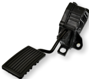
PPS1284 Honda Accord (2012-11) Honda Accord Crosstour (2011) Honda Crosstour (2014-12) VIO Over 600,000