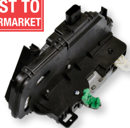
DLA1576 Ford Edge (2015-07) Lincoln MKX (2015-11) VIO Over 1.2 Million