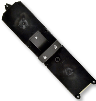
WST1732 GM Full Size Trucks & SUVs (2014-07) VIO Over 4.8 Million