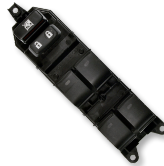
WST1735 Toyota Camry (2011-09) Toyota Land Cruiser (2013-08) Toyota Prius (2015-10) Toyota Venza (2012-09) Lexus CT200h (2013-11) VIO Over 2.3 Million