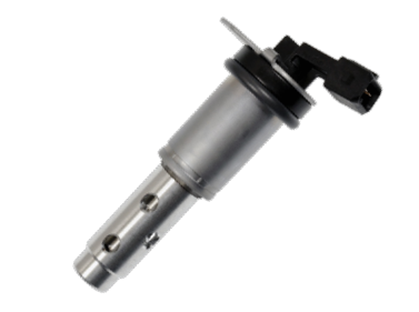
VV1046 Hyundai Elantra (2010-02) Tiburon (2008-01) Tucson (2009-05)

BWD<sup>®</sup> and Intermotor<sup>®</sup> are committed to increasing coverage for this important category. To date, here's a sampling of the VVT solenoid and VVT sprocket coverage that BWD<sup>®</sup> and Intermotor<sup>®</sup> already offer for domestic and import applications: