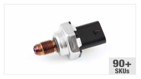
GDI Fuel Pressure Sensors