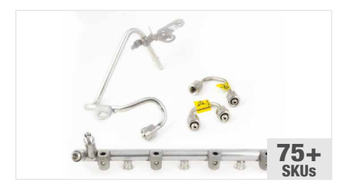
GDI High- & Low-Pressure Fuel Feed Lines