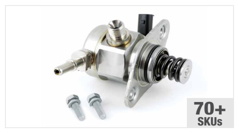
GDI High-Pressure Fuel Pumps