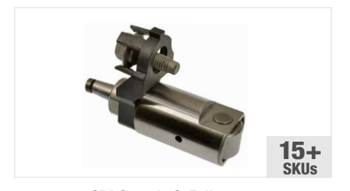
GDI Camshaft Followers

The best GDI injector can't perform as designed with restricted fuel lines or worn gaskets. BWD's GDI Program offers technicians everything they need for a complete GDI fuel system service.