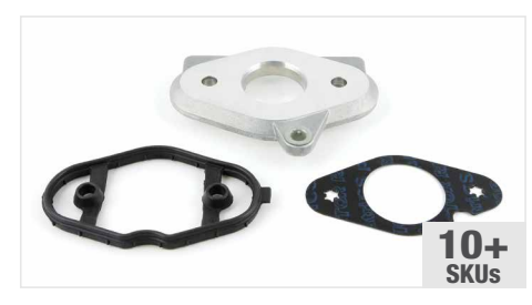
GDI O-Rings, Gaskets, and Plates