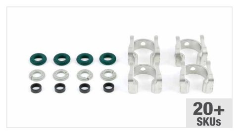
GDI Injector Seal and Service Kits

For more than 100 years, when the OE failed, technicians have trusted BWD® to deliver a part that's equal to or better than the original it's replacing.