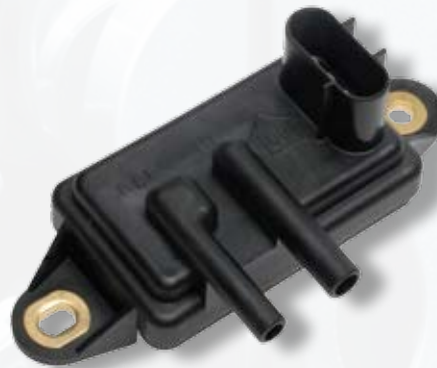
DPFE Sensor EGR155