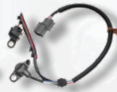
Honda Crankshaft Sensor CSS596