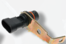
GM Crankshaft Sensor CSS123