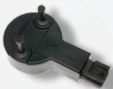
Ford Camshaft Sensor CSS149