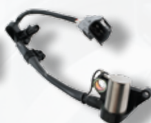
Toyota Crankshaft Sensor CSS839