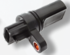
Nissan Camshaft Sensor CSS1464