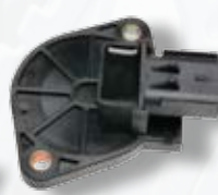
Chrysler Camshaft Sensor CSS1600