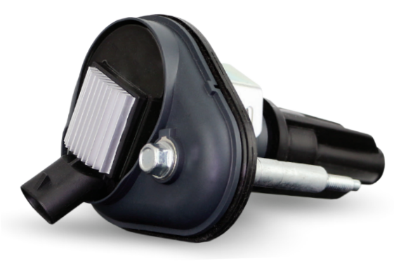
E255 GM (2008-02)

To see what goes into our ignition coil testing, take a look at this competitor comparison between our E255 and the OE: