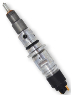
67616 Dodge Pickups (2010-08)