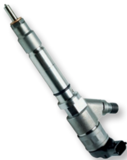
67562 GM Pickups, Fullsize Vans (2007-06)