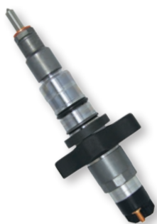
67532 Dodge Pickups (2004-03)