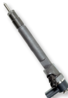
67522 Dodge Sprinters (2006-04)