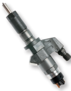
63877 GM Pickups (2004-01)