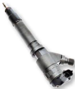
63871 GM Pickups (2005-04)

Here are some of our top selling Remanufactured Diesel Fuel Injectors for Common Rail Injection (CRI) systems: