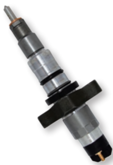
67533 Dodge Pickups (2009-04)