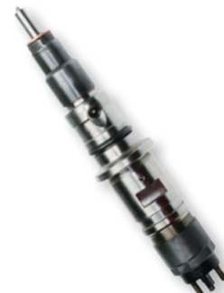
67617 Dodge Pickups (2010-07)