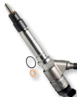
67561 GM Pickups, Fullsize Vans (2010-07)