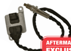
NOX1017 - Downstream Mercedes-Benz Trucks (2018-13) VIO Over 278,000