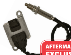
NOX1016 - Upstream Mercedes-Benz Trucks (2016-13) VIO Over 65,000