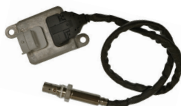
NOX1014 - Upstream Ram Trucks (2017-14) VIO Over 131,000