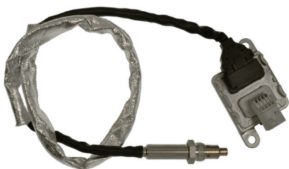
NOX1011 - Upstream

Ram Trucks w/ 6 Cyl. 6.7L Engines (2018-13)