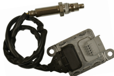
NOX1012 - SCR Catalyst Outlet

Ram Trucks w/ 6 Cyl. 6.7L Engines (2018-13)