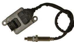
NOX1013 - Turbo Outlet Pipe Ram Trucks (2018-13) VIO Over 224,000

Ram Trucks w/ 6 Cyl. 6.7L Engines (2017-14)