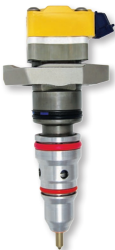
67526 Ford F Pickup, E-Vans (2003-99) International Trucks (2002-99)