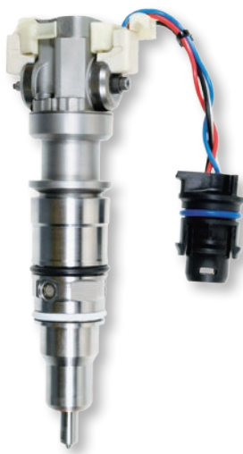
67527 Ford F Pickup (2004-03) International Trucks (2003-02)