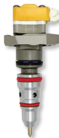
67320 Ford F Pickup, E-Vans (2003-99) International Trucks (2002-99)