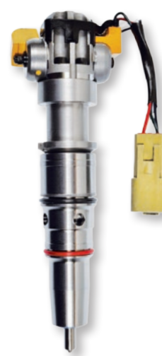
67846 International Trucks (2005-04)