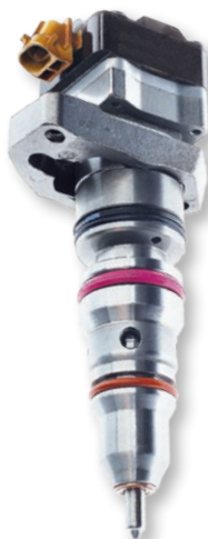
27613 Ford F Pickup, E-Vans (1999-95)