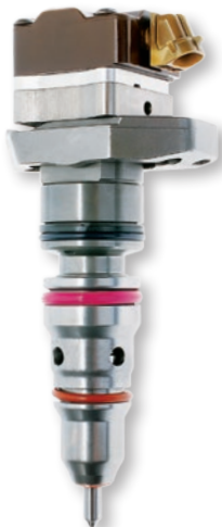
27190 Ford F Pickup, E-Vans (1998-94)

Here are some of our top selling Remanufactured Diesel Fuel Injectors for Hydraulic Electronic Unit Injector (HEUI) systems: