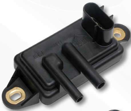
DPFE Sensor EGR155

To prevent a reoccurrence of the P0401 code, BWD® recommends inspecting and replacing if necessary, the EVR and DPFE hoses when replacing the DPFE sensor. To further guard against a P0401 code, a de-carbonization treatment of the EGR system should be performed.