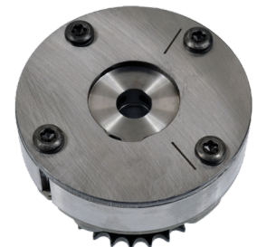
VV5056 Ford cars, trucks, SUVs & vans (2016-11) Lincoln luxury vehicles (2016-11) VIO Over 3.5 Million