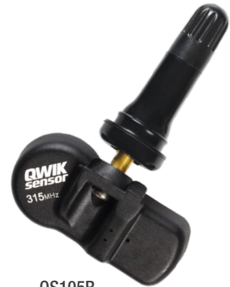
QS105R Universal VIO Over 109 Million