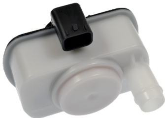
VDP14 Chrysler/Dodge/Ram cars, trucks, SUVs & vans (2017-06) Jeep Compass/Patriot/Wrangler (2016-07) VIO Over 7.7 Million