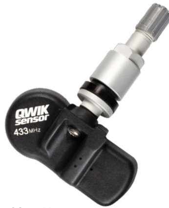
QS104M Universal VIO Over 15.4 Million

For today's advanced TPMS systems, it's more crucial than ever to choose premium replacements like our new Universal Programmable QWIK-SENSOR™ TPMS Sensors: QS104 for 433 MHz systems and QS105 for 314.9/315 MHz systems. Both sensors are NSF® Registered to ensure proper function on complex Auto-Relearn vehicles with complex TPMS technology such as LOCSYNC, PAL, POD, and WAL.