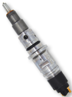
67616 Dodge Pickups (2010-08) 6.7L Cummins