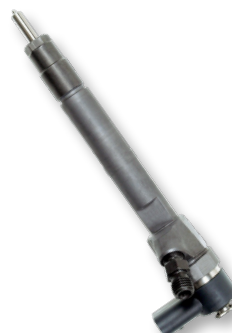
67522 Dodge Sprinters (2006-04) 2.7L Mercedes