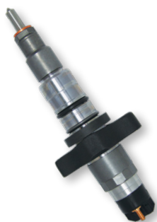
67532 Dodge Pickups (2004-03) 5.9L Cummins