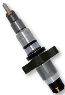
67533 Dodge Pickups (2009-04) 5.9L Cummins