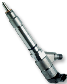
67562 GM Pickups, Fullsize Vans (2007-06) 6.6L Duramax