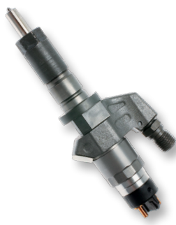
63877 GM Pickups (2004-01) 6.6L Duramax