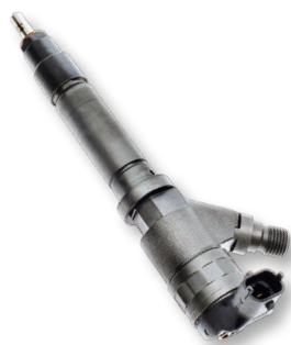
63871 GM Pickups (2005-04) 6.6L Duramax

Here are some of our top selling Remanufactured Diesel Fuel Injectors for Common Rail Injection (CRI) systems: