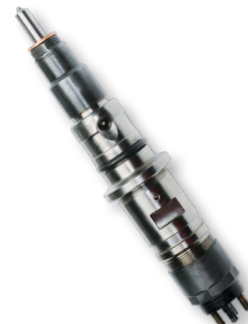
67617 Dodge Pickups (2010-07) 6.7L Cummins