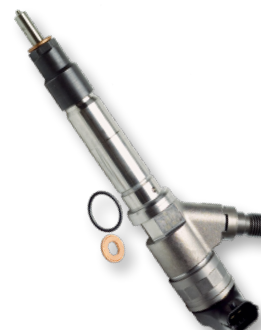
67561 GM Pickups, Fullsize Vans (2010-07) 6.6L Duramax